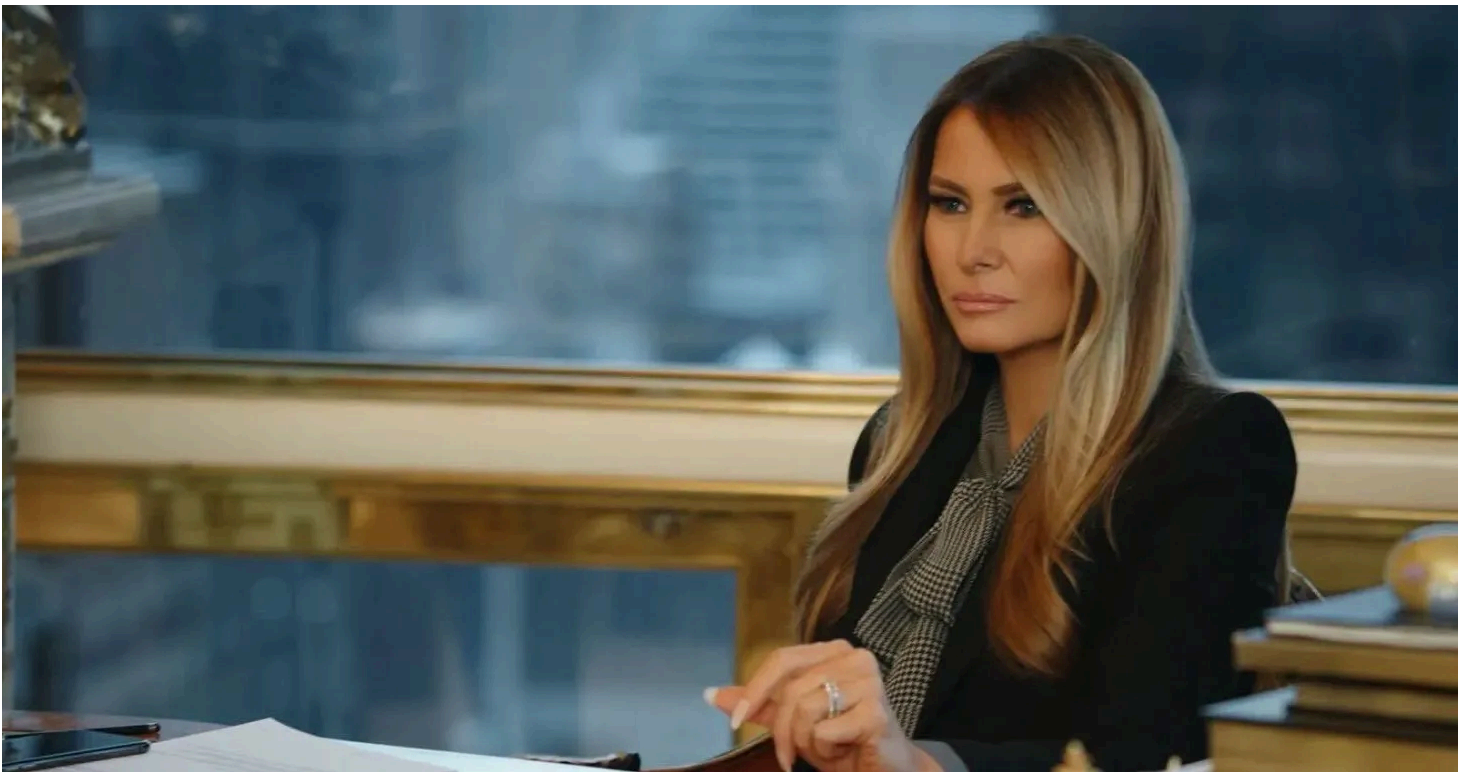
Mrs. Trump, Vanity Fair 12/17/25

Box office predictions are between $1 and $2 million opening weekend. (I picture Don Jr. and Eric hitting their daily debit card limits on Fandango to help break even a million.)