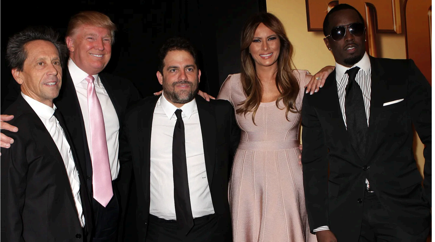
Brian Grazer, Donald Trump, director Brett Ratner, Melania Trump and Sean 'Diddy' Combs.

This whole movie thing is just another chapter in the Trump family grift, which at this point is so massive it makes my head spin. According to The New Yorker , the family has made $3.4 billion from Trump's time in office. Forbes says his net worth has nearly tripled from $2.3 billion in 2024 to $6.7 billion by the end of 2025. The House Judiciary Committee says their crypto ventures alone have added as much as $11.6 billion to the family's holdings. There are the meme coins - $427 million in fees. Jared Kushner's firm got $2 billion from the Saudis. Mar-a-Lago membership is now $1 million. They're doing real estate deals with Oman, Qatar, Saudi Arabia, and the UAE. All countries that just happen to be getting favorable treatment from this administration. And now Melania gets $28 million for a glorified home movie that no one will watch.