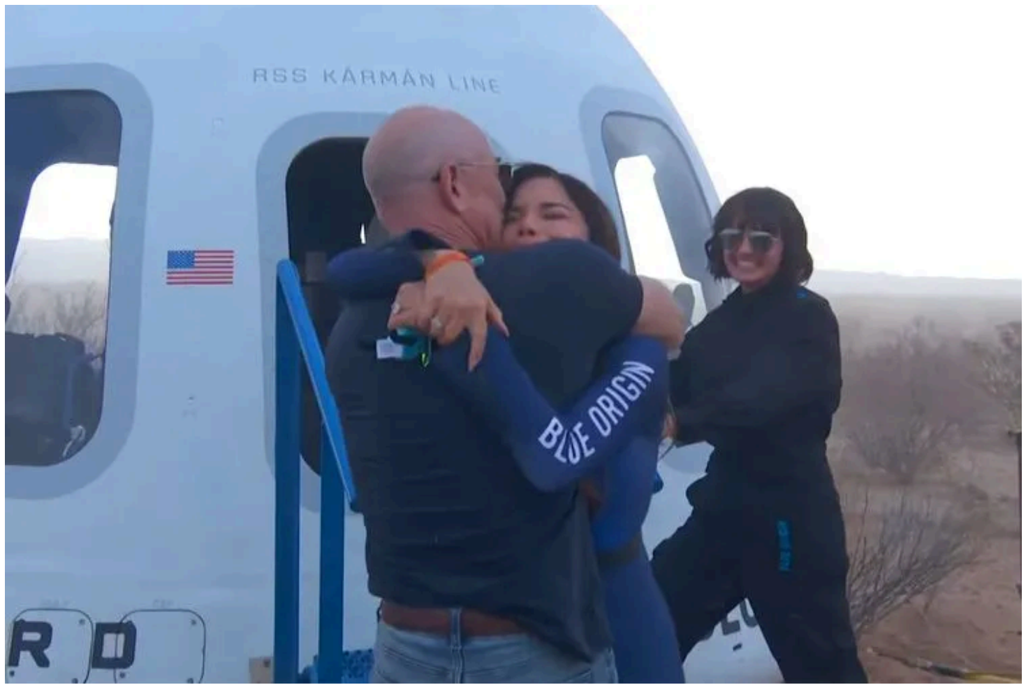
Bezos hugging then-fiancée Lauren Sánchez after her Neil Armstrong-lite flight on his phallic spaceship.

But here's where it gets real juicy. On the same day his newspaper announced they weren't endorsing anyone (incidentally the same day Kay Graham tried to crawl out of her grave and return to work), executives from Blue Origin - Bezos's space company - met with Trump. Blue Origin has a $3.4 billion NASA contract. Amazon Web Services is swimming in federal money. And a few weeks later, after Bezos had a nice little dinner at Mar-a-Lago, Amazon magically decided to pay $40 million for Melania's film . Bezos says there's "no quid pro quo." Sure, Jeff, you greedy, testosterone-filled lying trout.