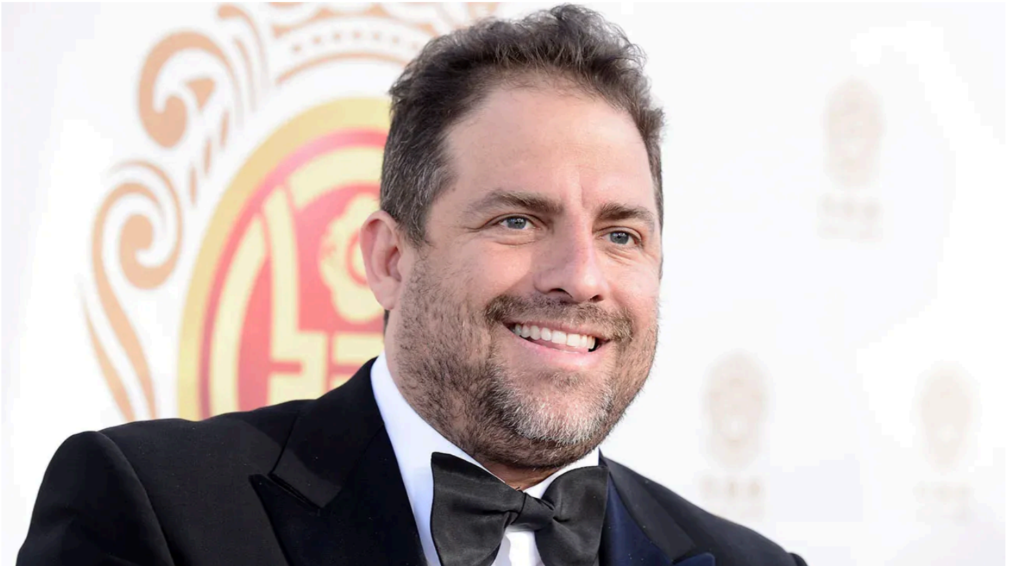
Ratner doing his best Harvey Weinstein in more ways than one.

Natasha Henstridge said Ratner forced her to perform oral sex on him when she was a 19-year-old model. Her exact words: “He strong-armed me in a real way. He physically forced himself on me.” Olivia Munn said he came out of a bathroom “furiously masturbating” when she brought food to his trailer. Elliot Page came forward that same month. Warner Bros. cut ties with his production company. His career was over. And who brings him back? The Trumps. Of course. Only this family would look at a man credibly accused of being a sexual predator and say, “Yeah, that’s our guy.” One crew member told Rolling Stone, “I feel a little bit uncomfortable with the propaganda element of this, but Brett Ratner was the worst part of working on this project.” Makes a person want a full “Silkwood” shower.